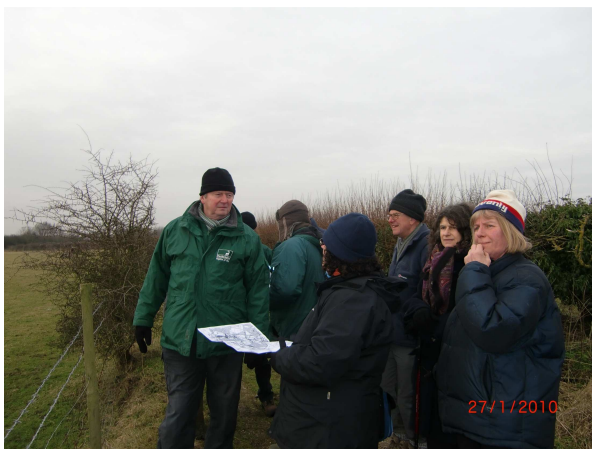
LAF members overlooking the Radlett SRFI proposed site.

Wall Hall was the second location visited by the Forum this winter. This former university site is owned by HCC and the farms around it are overseen by the Rural Estates team. As a result of the redevelopment of the buildings into private residences, s106 funding was secured to upgrade and improve the rights of way network on the site. A package of improvements including: upgrades to bridleways, creating routes along former missing links in the network and surfacing improvements are underway using that funding, with the cooperation of Hertsmere Borough Council's Greenways Officer, HCC's Rights of Way Service and the Rural Estates team.